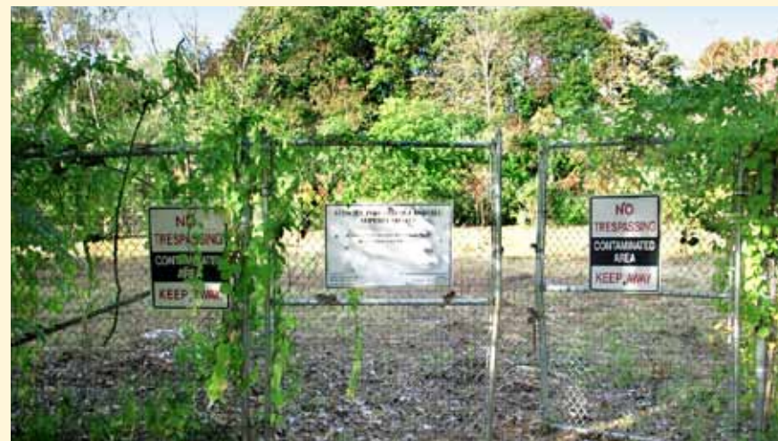
JMWA is working at several locations to clean up contaminated areas.