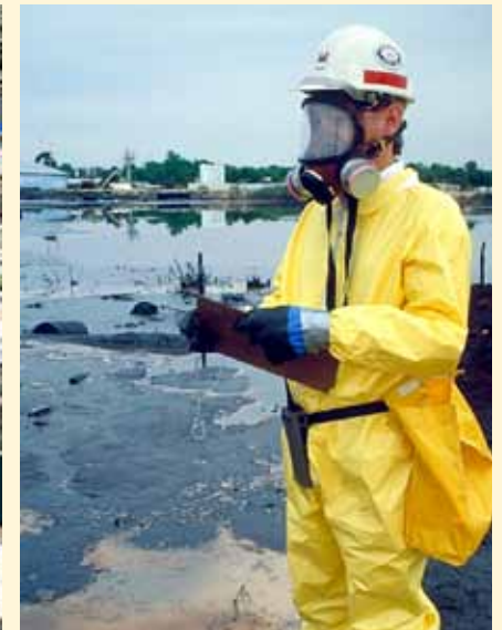
JMWA treats each project with the same dedication regardless of size or complexity.