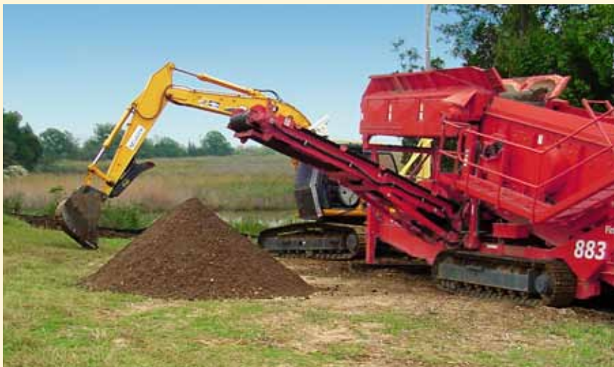
Soil removal for underground storage tank (UST) replacement