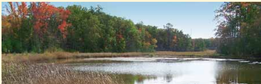
An example of wetlands resored to its natural state.